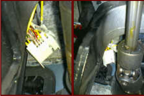
Wires installed to T15 connector.