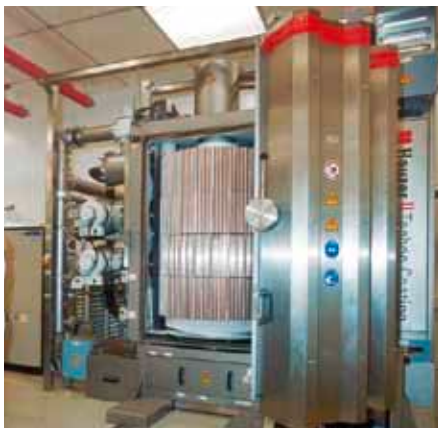
Fig. 3 Sputter plant